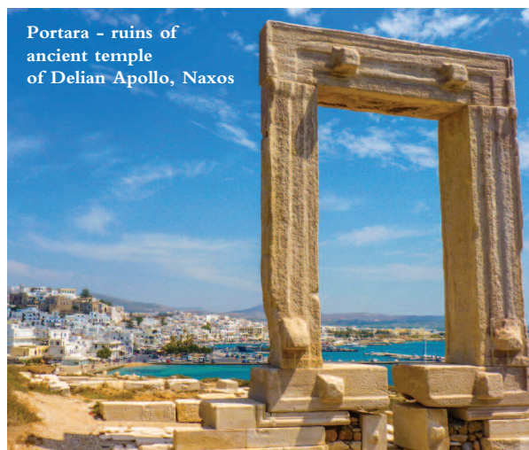
Portara - ruins of ancient temple of Delian Apollo, Naxos