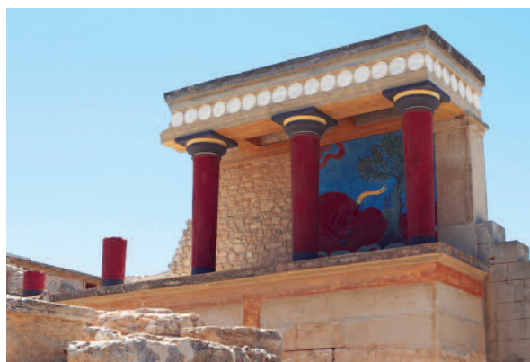
Palace of Knossos

Upon disembarkation transfer to the airport. (B)