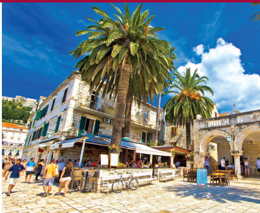
Palm Promenade in the Town of Hvar

Today enjoy the drive to Plitvice Lakes National Park, a UNESCO World Heritage site. The walking tour is around several of the lower lakes to