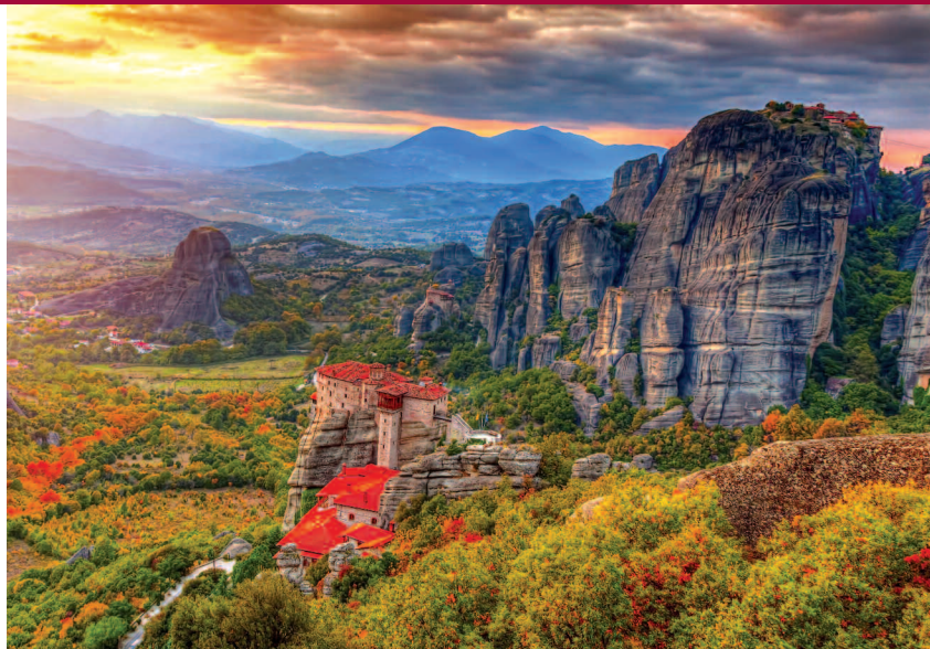
Monastery at Meteora

Single and triple occupancy rates available upon request. Tour prices are per person, based on double occupancy. Please ask about our affordable airfares.