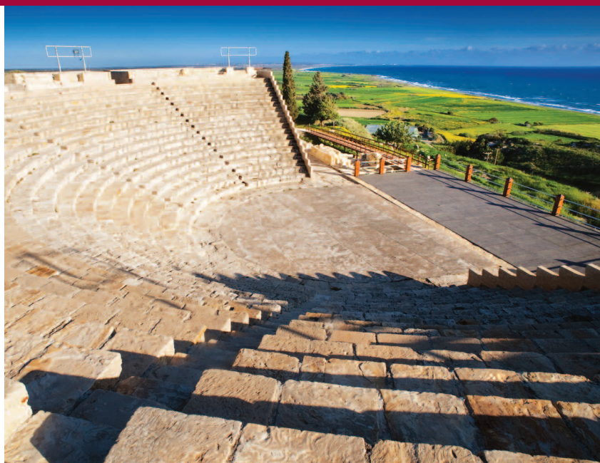
Kourion Greco-Roman Theater