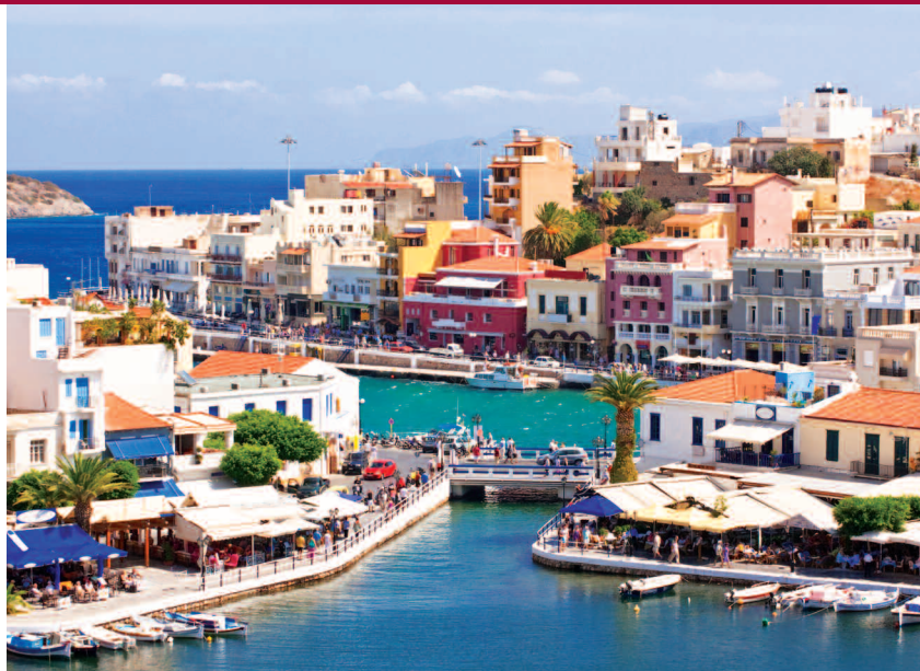
Agios Nikolaos, Crete