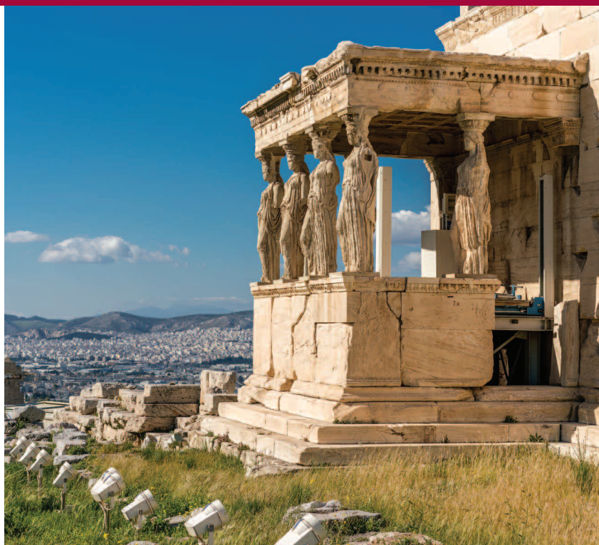
Caryatids at Erechtheum of the Parthenon

Single and triple occupancy rates available upon request. Tour prices are per person, based on double occupancy. Please ask about our affordable airfares.