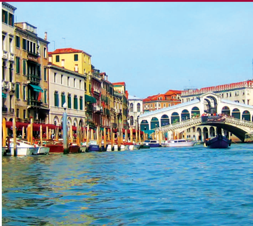
The Grand Canal in Venice

This morning transfer to the rail station to pick up the high speed train from Venice to Florence. Enjoy an interesting ride through Italy's most beautiful regions of "Veneto, Emilia