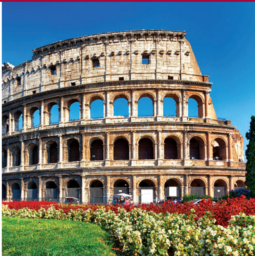
The Colosseum, Rome

Morning sightseeing features the Parthenon's crowning beauty atop the Acropolis, the Erechtheum with its Porch of Maidens, the beautifully