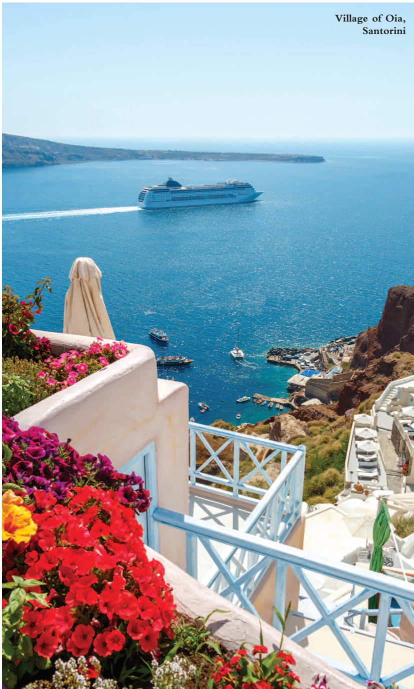
Village of Oia, Santorini

Disembark early this morning and transfer to the airport. (B)