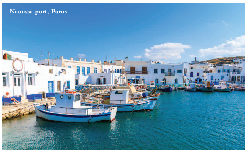
Naoussa port, Paros